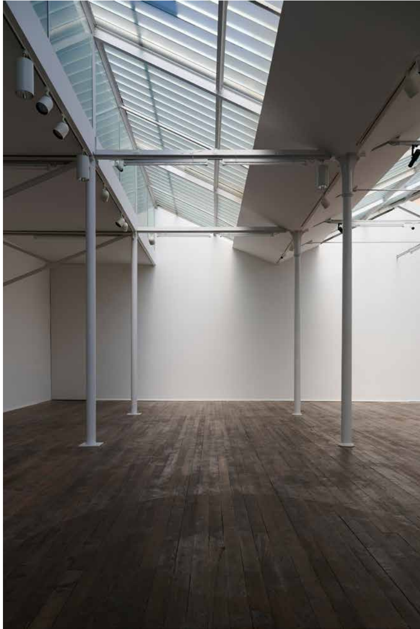
Galleria and Showroom Spazio maria calderara