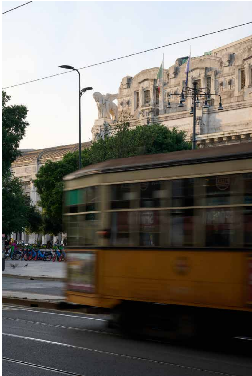
Tram ride, speeding through the city