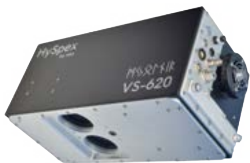
Figure 1: A HySpex Mjolnir VS-620 camera.

The shown mineral maps were created using MICA classification files provided by the USGS within collaborative efforts in CASERM, the Center to Advance the Science from Exploration of Reclamation in Mining. This effort is funded by the National Science Foundation.