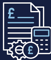
Public Liability Insurance