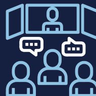
Business Interruption Insurance