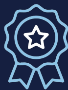
Professional Indemnity Insurance