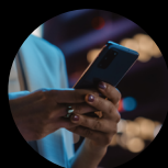
Chief Information Security Officer Leading Consumer Electronics Manufacturer

Staying ahead of the competition means guarding against insider threats. Cyberhaven gives us visibility into how data flows within our company and stops insider threats in real time.”