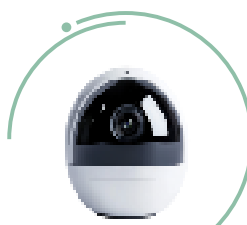
Audio/Video Baby Monitors