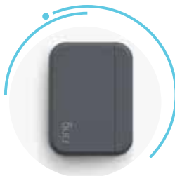
Pool Gate Sensor