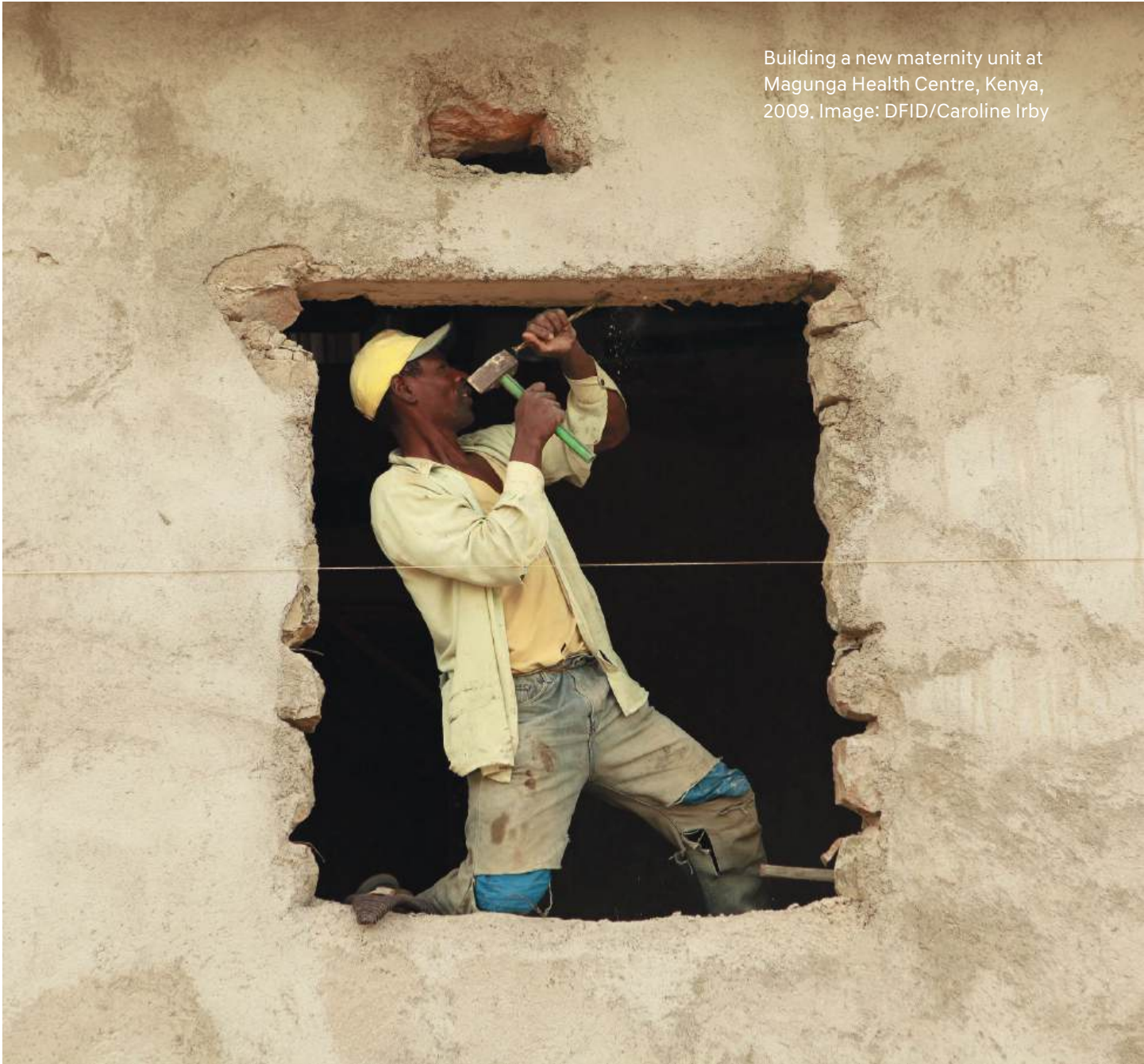
Building a new maternity unit at Magunga Health Centre, Kenya, 2009.