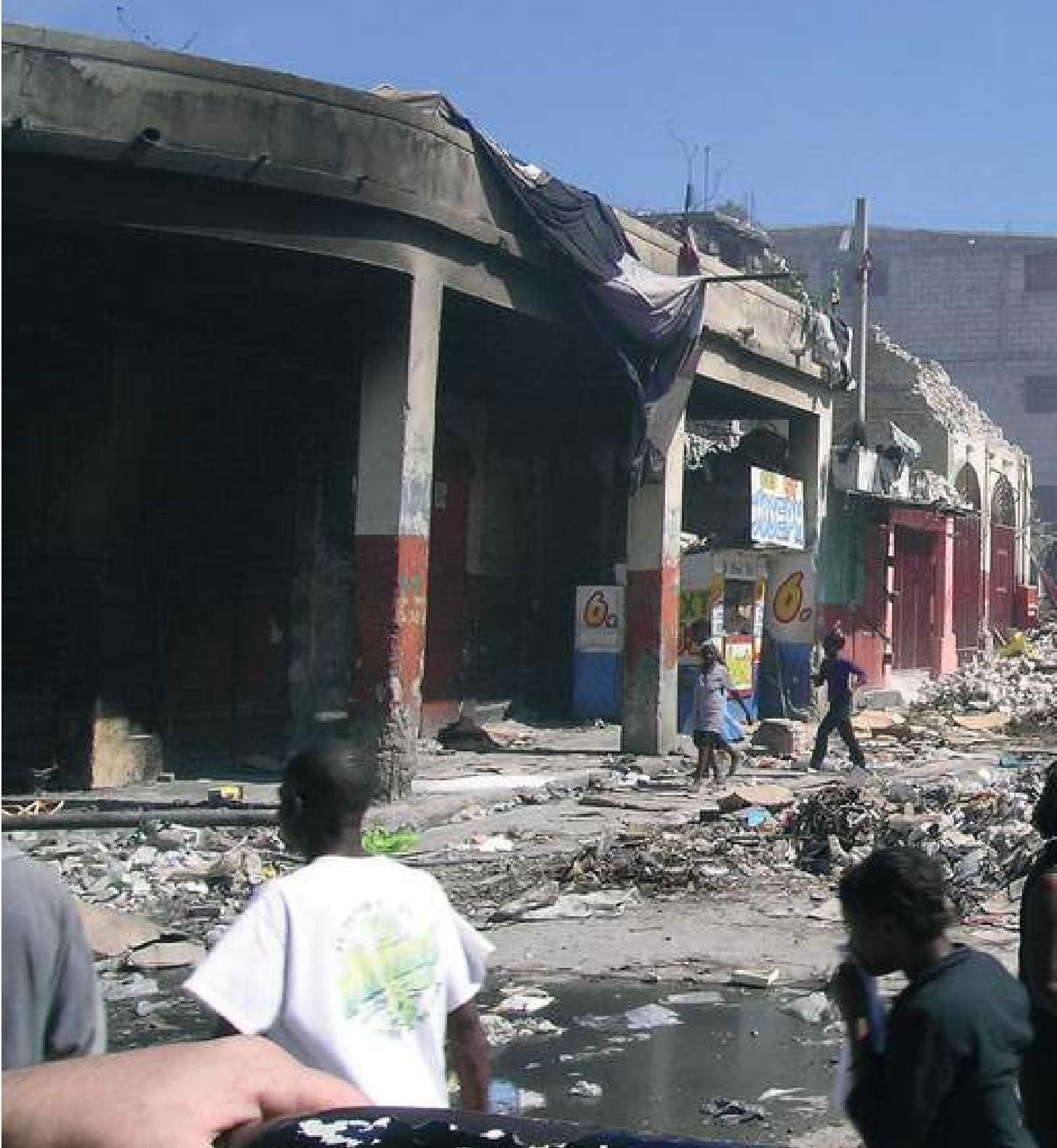
Scene of devastation in Haiti following the 2010 earthquake.