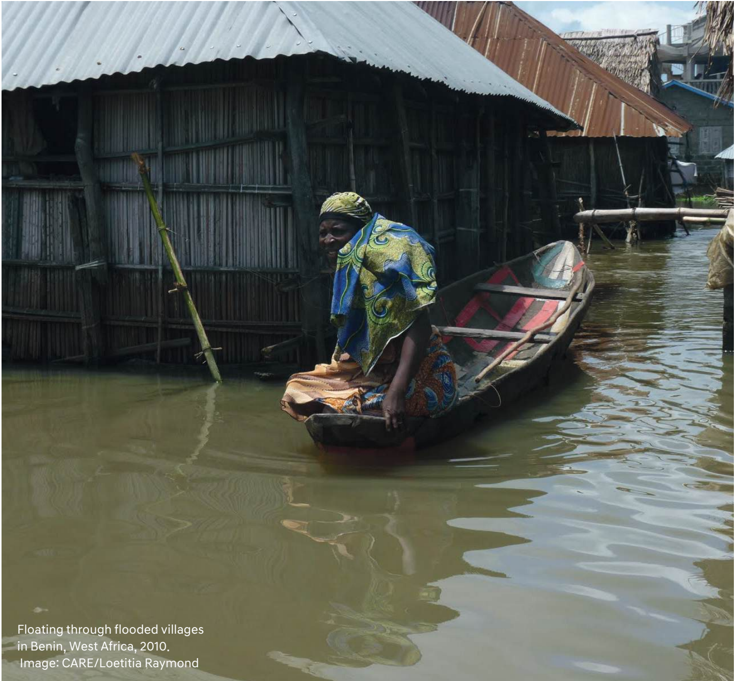
Floating through flooded villages in Benin, West Africa, 2010.