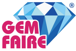
EXHIBIT SPACE CONTRACT SAN RAFAEL, CA Marin Center, Exhibit Hall 10 Avenue of the Flags (Zip: 94903) August 7, 8, 9, 2026

*Please note: Electrical outlet must be purchased with each booth.