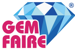
EXHIBIT SPACE CONTRACT COSTA MESA, CA

OC Fair & Event Center 88 Fair Dr. (Zip: 92626)