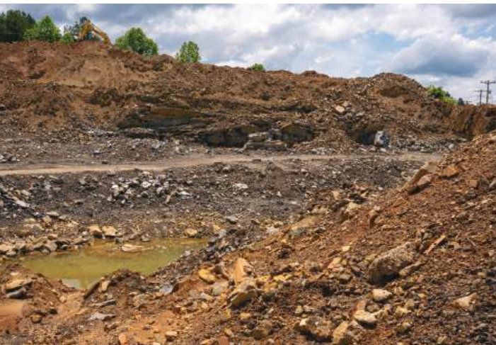
Mine land before Denali program