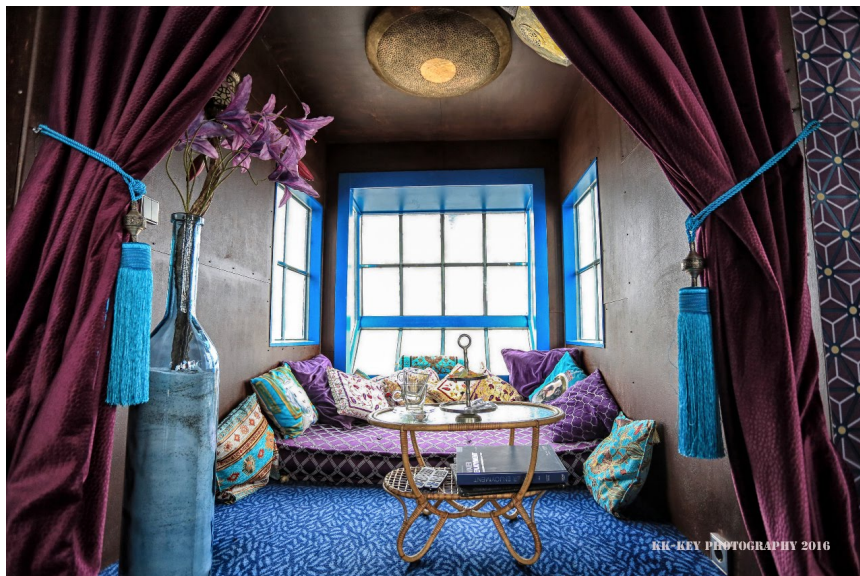
(Secret Suite; 45 meters)

pioneering developments. To finance and sustain the project, he introduced a New Business Model — one that merges commercial viability with cultural and societal relevance. Faralda is proof that sustainability is not a constraint —