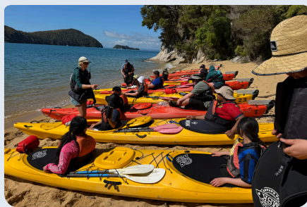
Grounded in Christ-like values

Our beautiful rural environment (Whenua) serves as a quiet canvas where students can explore their spiritual horizons (Wairua) and forge deep community connections (Whānau), preparing them fully to transition into confident, resilient NCEA senior pathways.