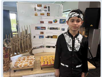
Authentic regional research & cuisine stalls

The LAC Intermediate Advantage: By combining specialist secondary-level facilities with small class sizes and deep pastoral care, we ensure our Year 7 and 8 students do not get lost in the crowd. Instead, they discover exactly who they are, anchor their values, and step forward into secondary school as capable, empathetic, and resilient leaders.