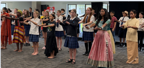
The World on Stage: Collaborative cross-cultural performance

At LAC, our vibrant multicultural makeup is not just a statistical feature—it is an active classroom asset woven directly into our academic design. Built directly into the Intermediate curriculum, the annual Cultural Showcase serves as a milestone learning project. Students research, practice, and publicly display their ancestral heritage through custom research stalls, traditional ethnic costuming, authentic regional food preparation, and collaborative musical ensemble performances. This cornerstone event transforms cultural diversity into a powerful living textbook, instilling deep cultural empathy, public presentation confidence, and an authentic sense of pride in identity.