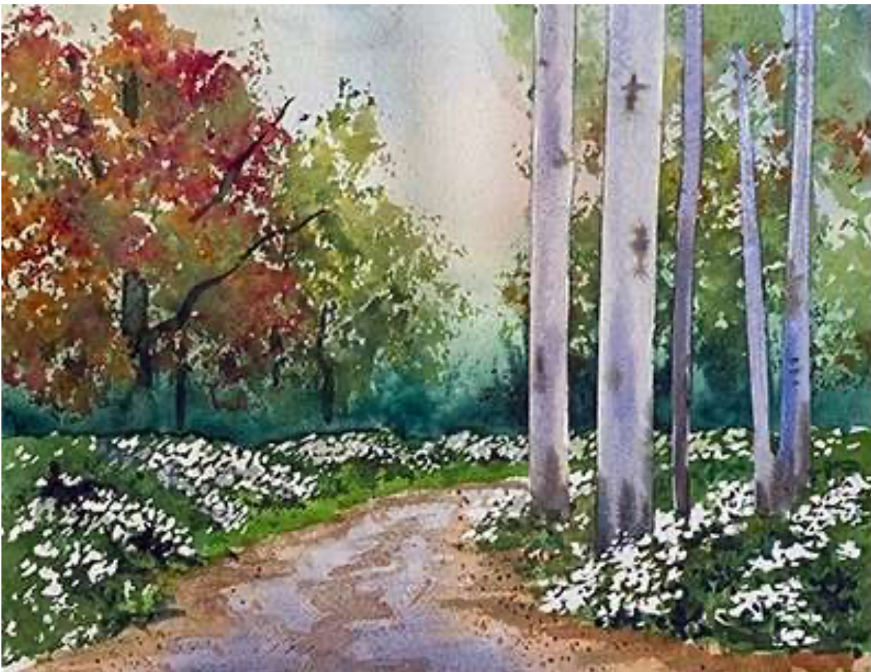
Above painting from Deb Watson in Genre, Landscape, Techniques

Techniques: Use a small piece of sponge (they hold a lot of water and paint). Wet the sponge, squeeze it out, dab it into the paint then dab it onto your painting . When creating trees and some flowers, dab on the lighter colors first. Allow that color to dry or almost dry before dabbing on a darker color. Practice first to master the technique.