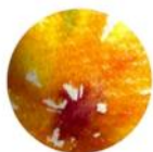
Mix Colors with Ease