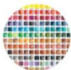
Widest Range of Colors to Choose From