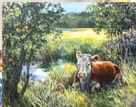
3rd Place—Queen of Green by Sue Rohrbach