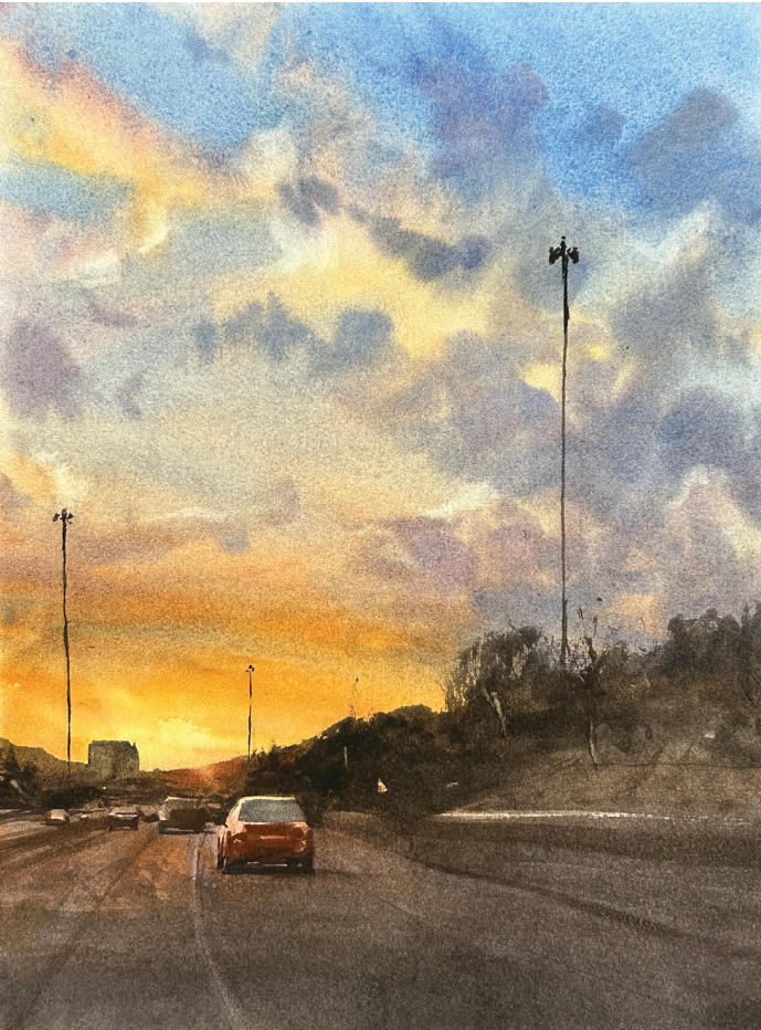
Darks and Details