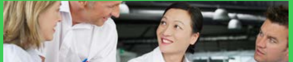
Contact us to start your journey.