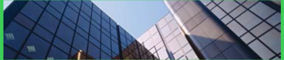
Learn more about EcoStruxure™ Power.