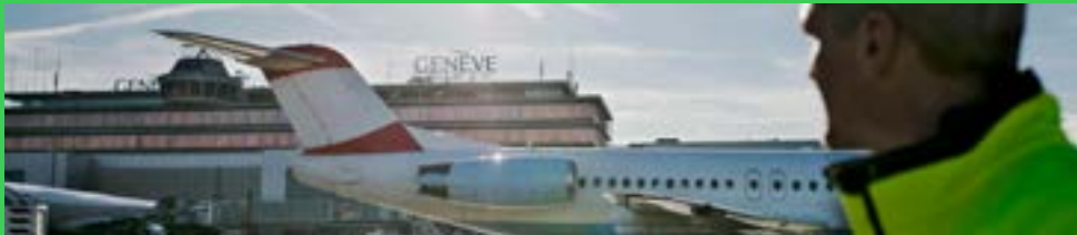
Geneva Airport: How EcoStruxure™ modernizes electrical distribution, from parking to departure, without delays.