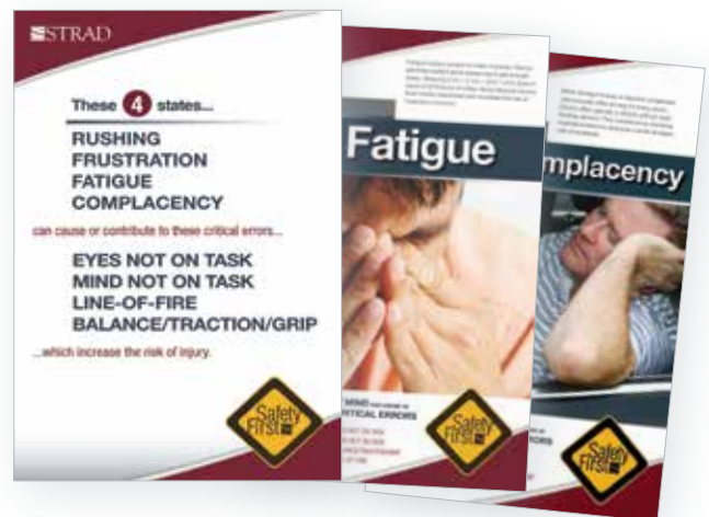
Figure #1 Strad has customized the SafeStart posters to support their "Safety First" messaging.