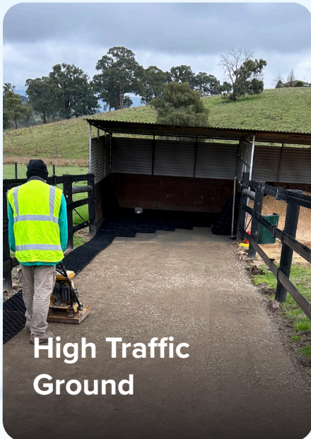
High Traffic Ground