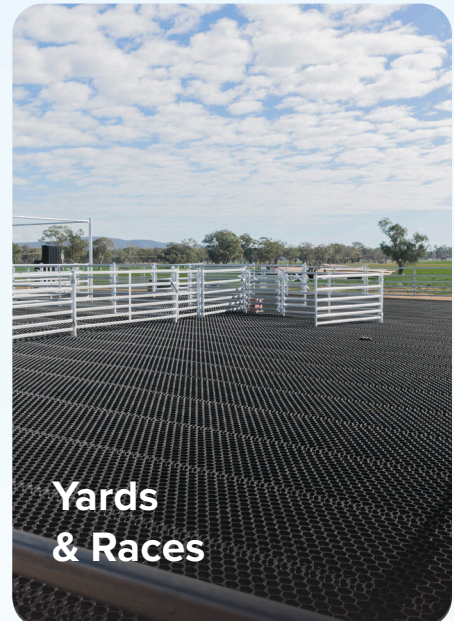
Yards & Races

For more information visit: geohexusa.com