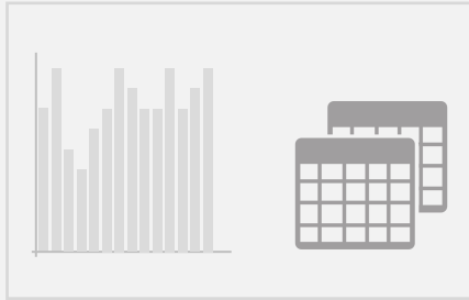
Projected cost distributions, reserve tables, stop-loss scenarios or reserve/stop loss tables