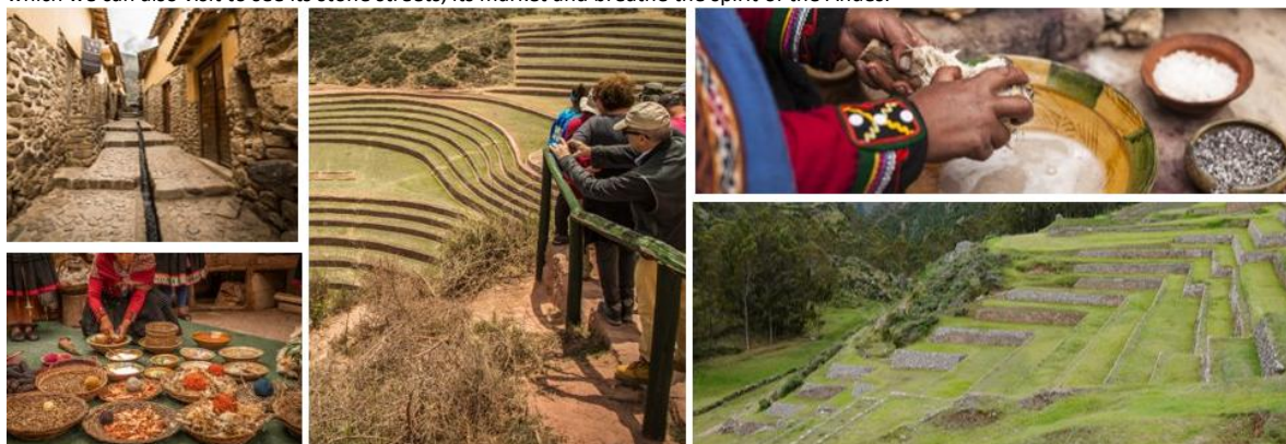
Accommodation at selected hotel in Sacred Valley. Meals included: Breakfast and lunch.

In the Sacred Valley we will find ancient history and living culture. We will visit Chinchero, a place where many communities are still organized under the Inca system of ayllus and proudly wear their typical costumes. We will take the opportunity to visit the Parwa cultural center. Here we will learn about the textile processes, the products from which the vibrant natural dyes are obtained, and the traditional weaving techniques used to manufacture them. In addition, we will be able to see the work of the artisans live and, if we want to take a souvenir with us, purchase some of their pieces. In a short walk we will pass in front of the church of Nuestra Señora de Monserrat and reach the archaeological complex, which during the Tahuantinsuyo was an agricultural and livestock center, with terraces and aqueducts. We will also arrive at the archaeological site of Moray, which during the Tahuantinsuyo functioned as an agricultural research center, something like a laboratory. Its enormous concentric terraces and the variety of microclimates they created allowed the growth of a wide variety of crops. In the valley we will also enjoy a typical lunch and visit Ollantaytambo, an ancient military, religious and agricultural center of the Incas. Strategically located on a mountain, it offers an unbeatable view of the town, the only one that maintains the original Inca urban design and which we can also visit to see its stone streets, its market and breathe the spirit of the Andes.