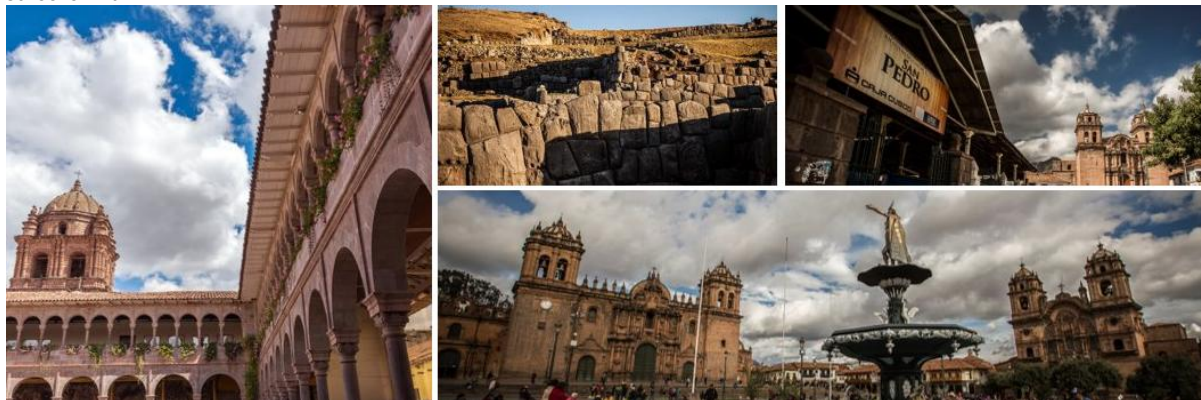
Accommodation at selected hotel in Cusco. Meals included: Breakfast.

convent was later built as part of the evangelization process. Its baroque style façade built on solid Inca walls perfectly summarizes the syncretism of cultures in the city of Cusco. To appreciate the greatness of the Incas, we will ascend to the monumental fortress of Sacsayhuaman, which with its enormous carved stone walls constitutes one of the best examples of Inca military architecture. We will tour the archaeological center of Kenko, a ceremonial place where the sun, the moon and the stars were worshiped. We couldn't take a tour of the city without visiting the Cathedral, the most important temple in the city. It was built by the Spanish on top of the palace of the Inca Huiracocha. Its interior houses a wonderful collection of colonial art composed of goldsmith pieces and representative canvases of the Cusco School of Art.