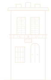
150 San Sebastian Old San Juan