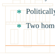
Casa Armstrong-Poventud - Ponce

"Tú no eres mejor que nadie, pero nadie es mejor que tú."