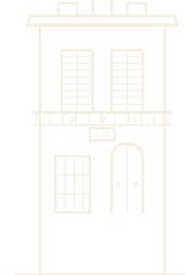
150 San Sebastian Old San Juan