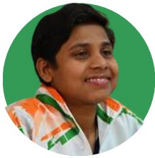
Mana Mandlekar Tinka Samajik Sansthan