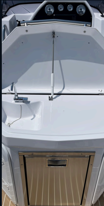
CENTRAL CONSOL Fridge · Worktop