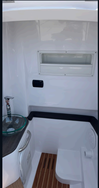
BATHROOM Sink · Mirror