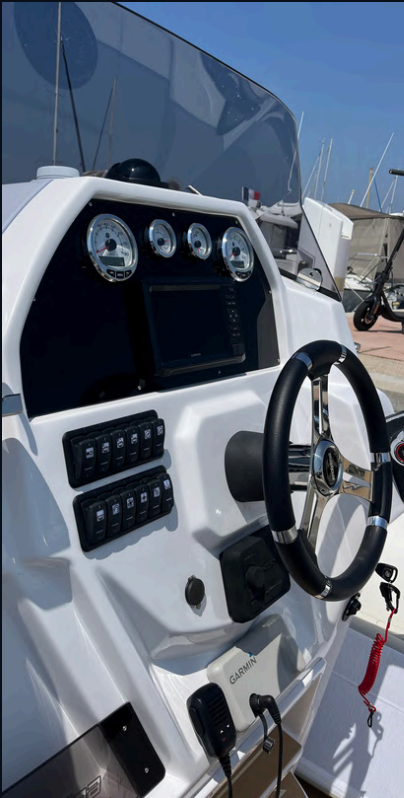
DRIVING CONSOL Sound system · Garmin