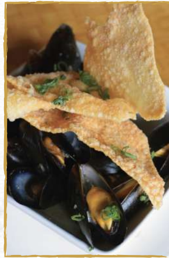
DESAKI SAKE MUSSELS