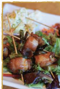
BACON WRAPPED SEA SCALLOPS