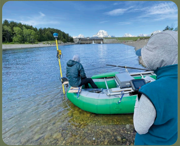
Park scientists monitor alpine glaciers in the high peaks and outflows from Jackson Lake Dam as part of a comprehensive study to better understand the impact of climate change on the Snake River watershed.

“...the most important role of SRM is to understand Grand Teton as an inter-related, inter-dependent system. This means not managing each resource on its own, but rather understanding how all resources—vegetation, wildlife, water, and landscape—are inextricably linked.”