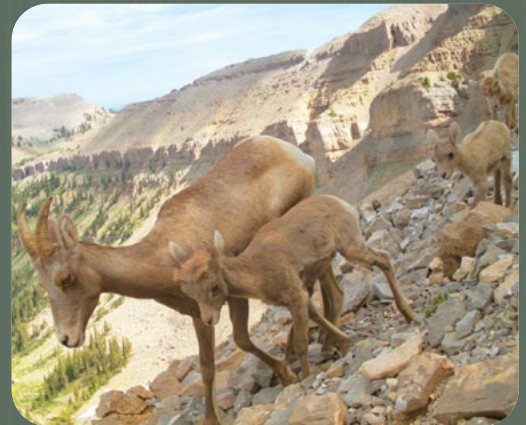
Left: Migration paths of mule deer that summer in and around Grand Teton National obtained with GPS and satellite uplink technology. The paths reveal distant winter ranges and critical corridors in need of protection. Top right: Use of handheld telemetry antennas has been nearly eliminated because of GPS telemetry advancements. Bottom right: DNA from bighorn sheep scat collected at mineral licks has been used to estimate Teton Range population size.

imal-mounted transmitters to researchers in real time via satellites became available—enabling another huge step forward in the diversity of study designs. Park biologists and their collaborators began using this technology on nearly all their transmitters. GPS transmitters can now also relay data via cell phone towers where adequate service is present, conserving precious battery power and extending transmitter life. And, with improvements in battery and electronic miniaturization, nearly any size of animal can now be tracked with GPS technology. Today, units as light as one gram (half the weight of a dime) are available.