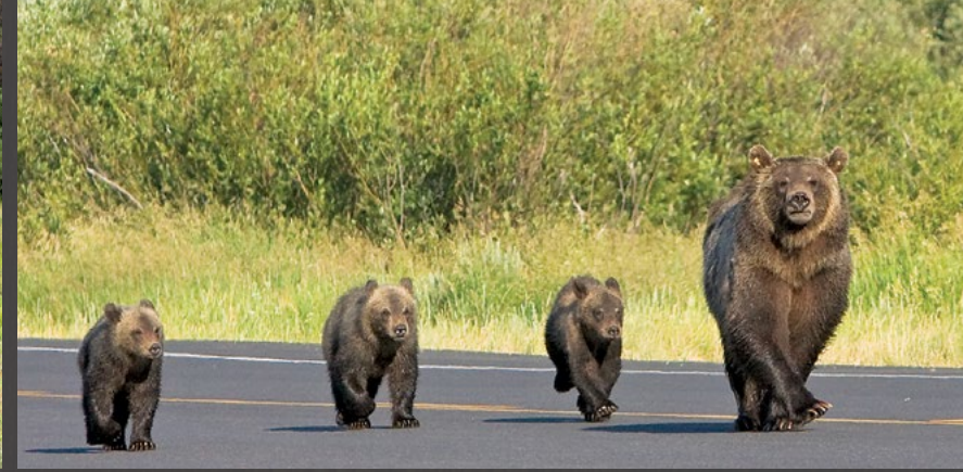
Photos 2011—Left: Grizzly bear 399 and her cubs of the year in early summer. Right: Grizzly bear 610 with her two cubs and one cub adopted from 399's litter. Below: Twenty-four-year-old 399 with her rare four cub litter in 2020.