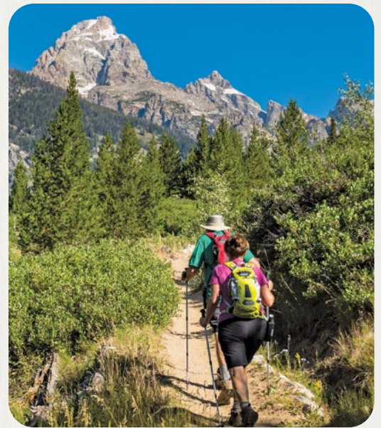
Teton Raptor Center biologists have improved studies of nesting great grey owl population dynamics through new bioacoustics monitoring applications ( left ). DNA analyses have helped determine the conservation status of the park's small, isolated sage grouse population ( middle ). New indices of human activity on the landscape, which can have profound impacts on wildlife, are being used to better assess visitor impacts and how to mitigate associated effects on wildlife ( right ).

sampling water in likely stream courses, rather than conducting the exhaustive physical surveys of the past (which also disturbed these reclusive birds). Using DNA metabarcoding, which can identify multiple species from single samples, researchers are determining diets of big-horn sheep as part of a nutritional carrying capacity study, as well as contrasting prey of wolves, coyotes, and red fox.