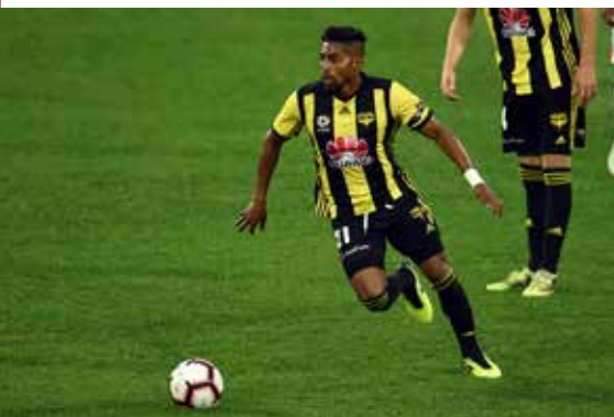
PHOENIX V WANDERERS 17 March 2019