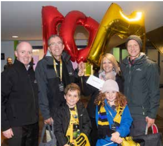
10 MILLIONTH FAN 8 March 2019