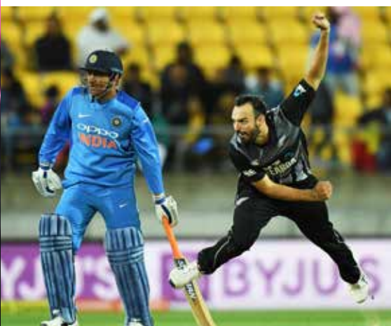
BLACK CAPS V INDIA 6 February 2019