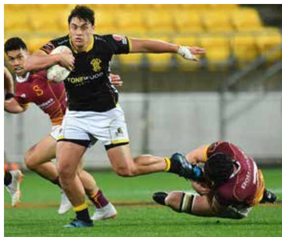
WELLINGTON LIONS V SOUTHLAND 31 August 2018