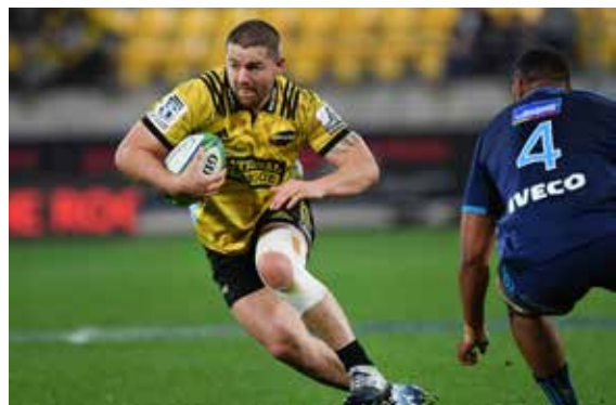
HURRICANES V BLUES 15 June 2019