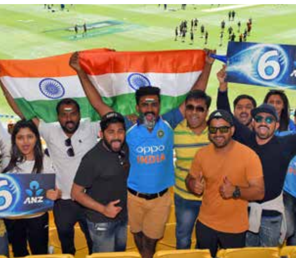
CRICKET FANS 3 February 2019