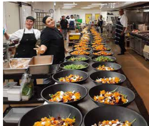
TE MATATINI 21-24 February 2019