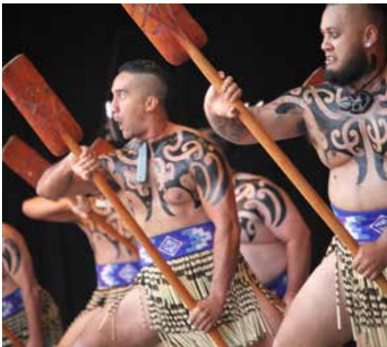
TE MATATINI 21-24 February 2019