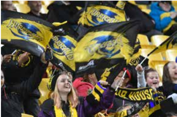
HURRICANES FANS 8 March 2019

We welcomed back the team from Nitro Circus for the fourth time. The very talented team provided a spectacle of stunts that delighted a crowd of almost 12,000.