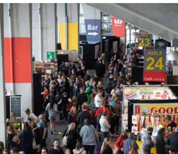
FOOD SHOW 24-26 May 2019