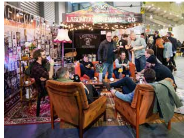
BEERVANA 10-11 August 2019