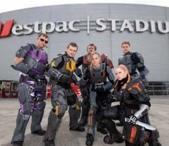
ARMAGEDDON 13-15 April 2019