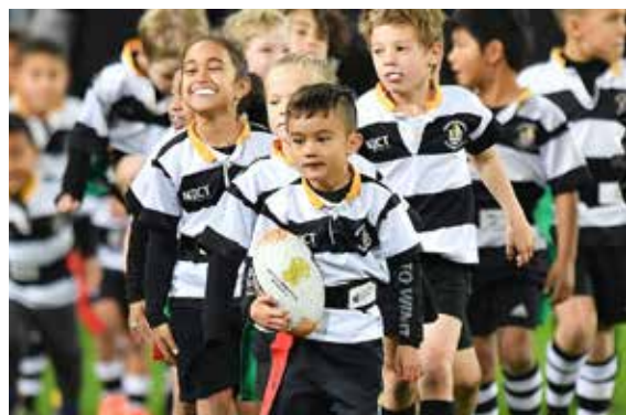
HURRICANES V BULLS 22 June 2019