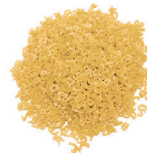
➤ Alphabets & Numbers

→ Available in a wide variety of long and short shapes to suit diverse recipes as well as regional preferences.