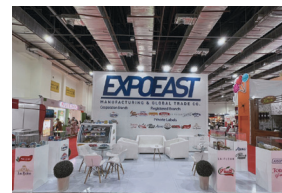
➤ Food Africa, 2022