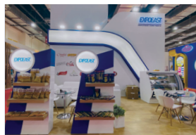
➤ Food Africa, 2023