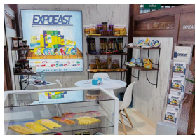
➤ Sial, 2024