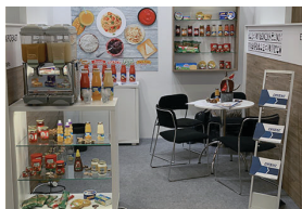
➤ Anuga, 2019