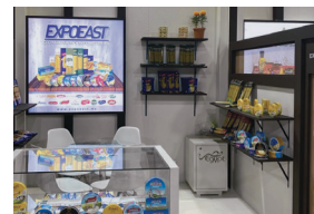
➤ Gulfood, 2024