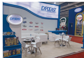
➤ Food Africa, 2024