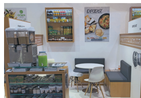
➤ Gulfood, 2020