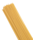
➤ Spaghetti 2.2