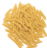
➤ Penne Lisci