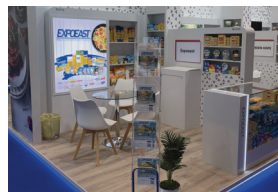
➤ Gulfood, 2023