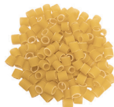
➤ Small Rings