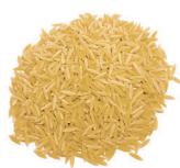
➤ Big Rice