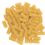
➤ Big Rings