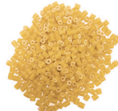
➤ Lisci Rings