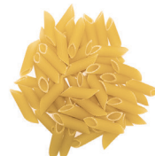
➤ Penne Rigate