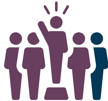
CHARACTER BUILDING PROGRAM