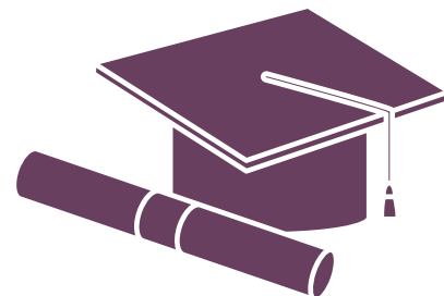
HIGH SCHOOL DIPLOMA