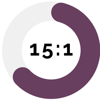
STUDENT TO TEACHER RATIO