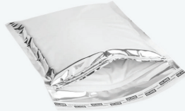
Insulated Silver Mailer