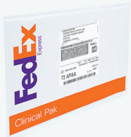
FedEx Clinical Pak w/ Prepaid Overnight Shipping Label