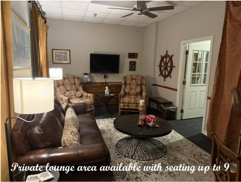
Private lounge area available with seating up to 9