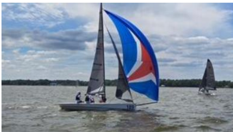
Team TYC – Spring Regatta at Buccaneer Yacht Club