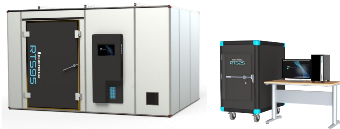
Figure 2: Bluetest's RTS95 and RTS25 chambers.

A typical setup might place the drone in an RTS95 chamber, while the controller and video goggles reside in an RTS25 chamber. The chambers are interconnected via coaxial cables and a programmable attenuator. This allows fine-grained simulation of link degradation due to distance—where a 6 dB increase in path loss approximates a doubling of physical distance in line of sight (LoS) conditions.