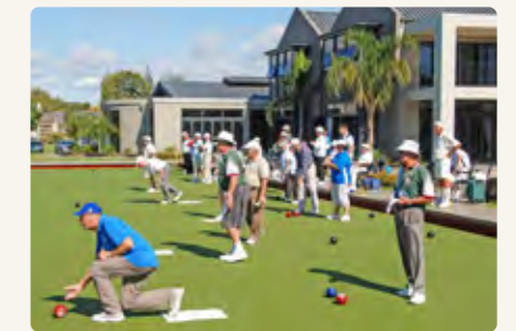
Bethlehem Country Club