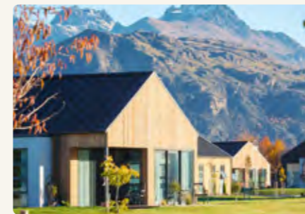
Queenstown Country Club