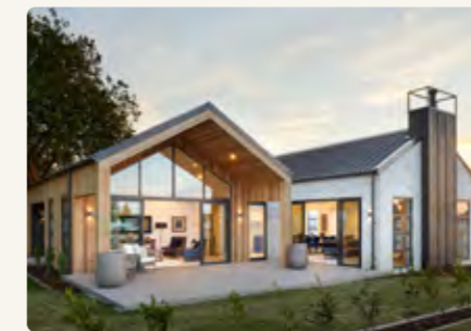
Tamahere Country Club