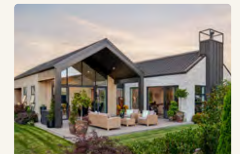
Matamata Country Club