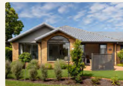
Ōmokoroa Country Estate