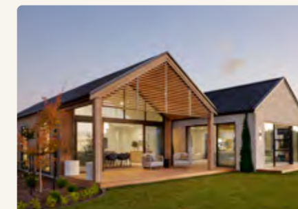
Ōmokoroa Country Club