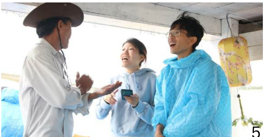
Riversity: Exploring Life, People, and Livelihoods on Thu Bon river in Cẩm Kim, Hoi An in November 2023