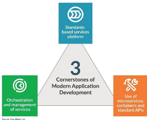
Figure 1-1: The cornerstones of modern app development

various facets of automating the deployment, operations, and scaling of containers across an environment consisting of clusters of host systems can pose significant challenges.