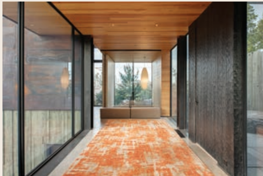
FROM TOP: Three main design elements — COR-TEN steel, board-formed concrete, and glass — come together alongside natural wood interior paneling to create living spaces within a cozy alpine home. • An expansive great room further underscores elegant simplicity of design, while offering stunning views of ski slopes that terminate right outside the home’s boot room.

According to Cobb and Taylor, this sentiment guided Outcrop’s design from the very beginning. “Ordinarily, the landscaping of a site happens at the end, but in this case, we were working with Bruce Hinckley [of Alchemie] from day one,” Cobb says. Taylor agrees: “Our design was deeply influenced by the site context itself. We allowed the home to respond to the surrounding space, to live as part of the slope.”