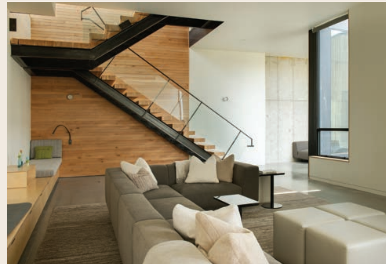
The interior color palette illustrated in this ground-floor great room invites relaxed conversation in a sun-filled setting.

The interior spaces display a similar reverence for space and light, adapting the motif of simplicity and efficiency to create a sense of quietude, an inviting reprieve from the elements. Throughout the house, rooms are detailed with the simple elegance of Baltic birch veneer cabinetry. The boot room adopts the same aesthetic, but beneath the surface resides