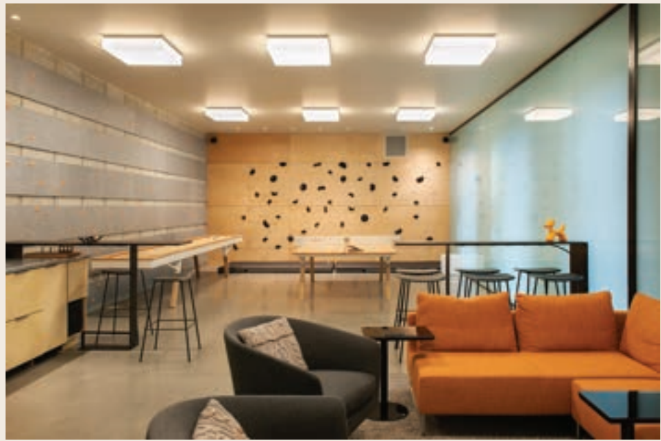
Among the innovative features of this home is a stylish recreation room, complete with an indoor climbing wall, ping pong table, and shuffleboard.

Lennon says that one specific challenge was building the living room deck and its immense wall. “That whole space is cantilevered,” he says. “It’s a massive structural element that appears to float with no apparent support.” Cobb expresses similar pride in that element, noting that it generates “fantastic drama.”