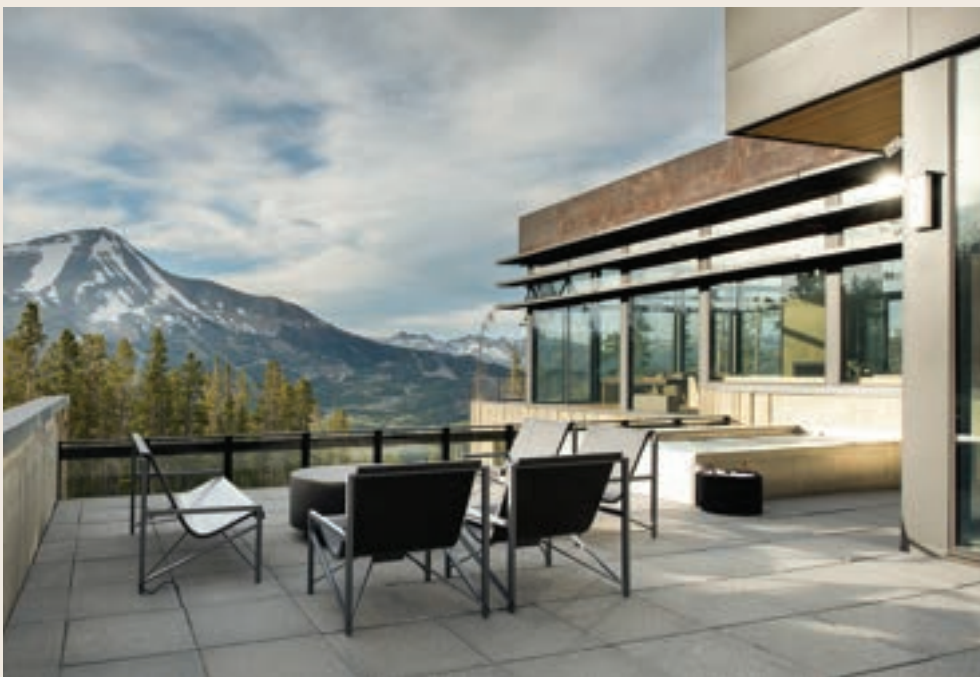
The home is wrapped with heated decks that offer mountain vistas in every direction.

mountain landscape. Its design originates from philosophical principles that connect the two. And, if the materials used in construction properly match the elements furnished by nature, you find yourself in a singular space that invites seamless movement from indoors to out. As Cobb explains, “When you’re in the presence of Outcrop, you are surrounded by raw, textured, and authentic materials, not applied finishes. The actual wood structure, steel frames, concrete walls, and COR-TEN skins are the fundamental nature of the project, inside and out. This full experience of the material and texture composition is grounding in its authenticity.”