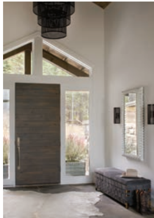
FROM TOP: Western and contemporary touches come together in the entry, where a bench with suede strapping complements the pierced-metal chandelier and sconces by Oly. • The homeowners' bedroom features both rustic and contemporary styles, with a hide-covered night table by Interlude Home, bed linens from Legacy Home, and curtains made from Thistle Garden Linen by Sanderson Design Group.

In a similar spirit, the interior walls were surfaced with drywall and painted a soft shade of white, instead of the rough-hewn wood that's often used in rustic homes. That provided the perfect backdrop for the contemporary furnishings, fabrics, and finishes that were chosen by the Toledo, Ohio-based interior designer Pamela Straub, in collaboration with the homeowners. "We