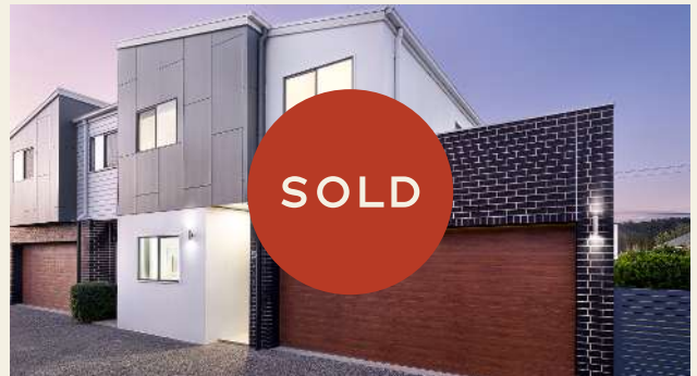
SOLD - $1,130,000 | 3 BED 2 BATH 5/32 CHARLES STREET, WARNERS BAY