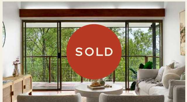
SOLD - $987,000 | 3 BED 2 BATH 91 HAMBLEDON HILL ROAD, GOWRIE