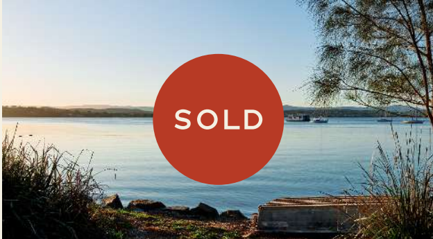
SOLD - $1,453,000 | 4 BED 3 BATH OFF MARKET