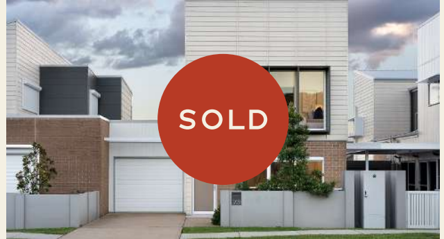
SOLD $1,072,000 | 3 BED 2 BATH 3/2B EAST STREET, WARNERS BAY