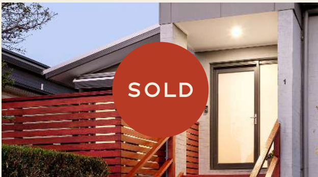
SOLD - $775,000 | 2 BED 2 BATH 1/50 LACHLAN ROAD, CARDIFF