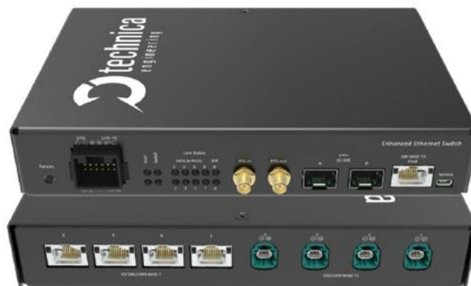
Enhanced Ethernet Switch MACsec Hybrid

The EES MACsec H-MTD provides a reliable gPTP/802.1AS-2011 automotive profile stack which is also compatible with 802.1AS-2020. In addition, the stack partially includes the IEEE 1588-2008 standard for time synchronization that allows various customization possibilities to adapt to many customer use cases.