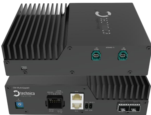
Capture Module MultiGigabit

The CM offers a flexible and user-friendly configuration through its built-in web server. The device webpage can be easily accessed via a standard web browser. In addition, the possibility to import/export a configuration makes it even more convenient.