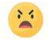
Anger & Sadness