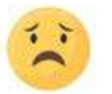
Fear & Anxiety