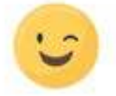
Empathy & Altruism