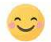
Hope & Optimism

And ... don't forget to include a clear, persuasive call to action.