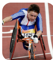
Tanni Grey-Thompson – Paralympian Wheelchair Racer