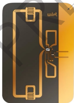
Humidity IoT Pixels

Wiliot offers reference designs for its IoT Pixels, which third-party Works with Wiliot OEMs manufacture and sell to end users. The final product's features and performance may vary based on the choices made by these OEMs. This datasheet describes a standard embodiment.