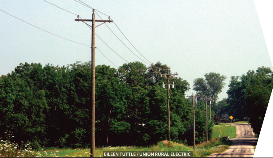
EILEEN TUTTLE / UNION RURAL ELECTRIC