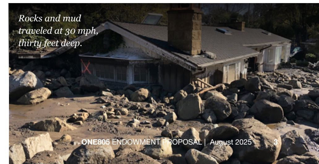
Rocks and mud traveled at 30 mph, thirty feet deep.