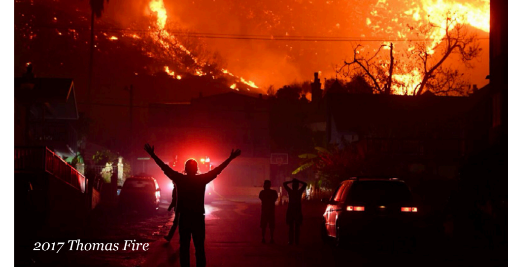
2017 Thomas Fire

For them. For their families. For all of us.