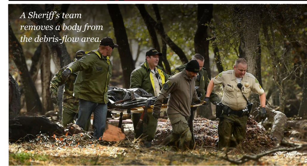
A Sheriff's team removes a body from the debris-flow area.