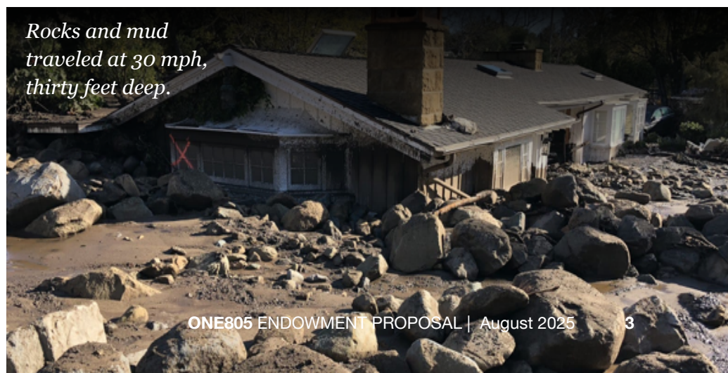
Rocks and mud traveled at 30 mph, thirty feet deep.