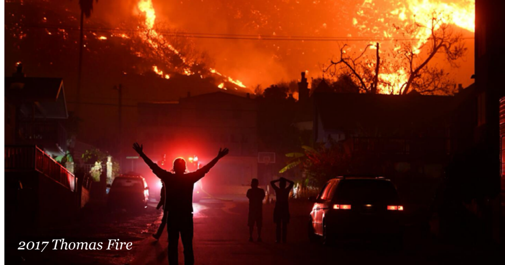
2017 Thomas Fire

For them. For their families. For all of us.