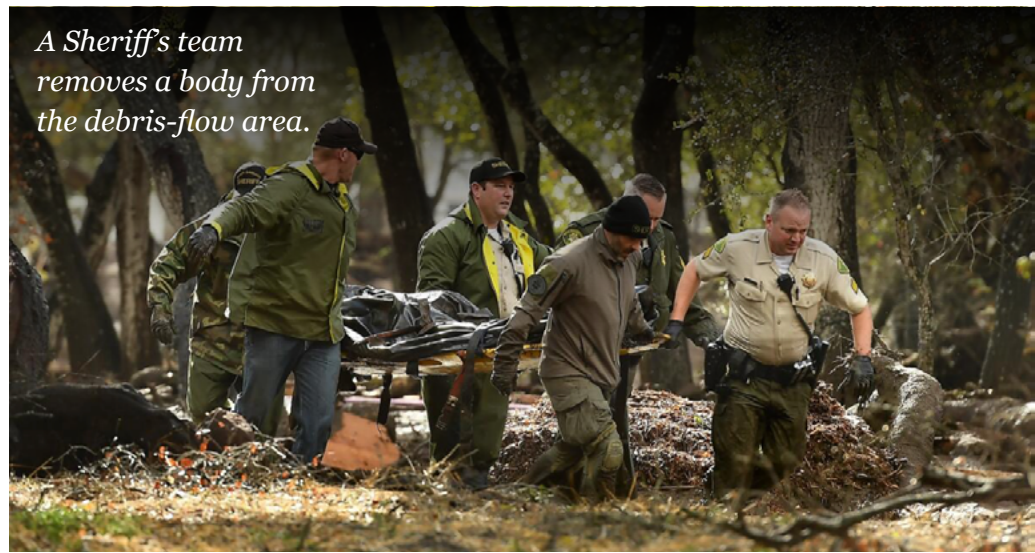
A Sheriff's team removes a body from the debris-flow area.