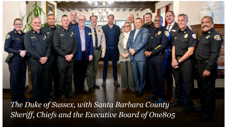
The Duke of Sussex, with Santa Barbara County Sheriff, Chiefs and the Executive Board of One805

50% avoid treatment due to stigma, judgement, and fear of career impact. Frontiers in Public Health, 2022