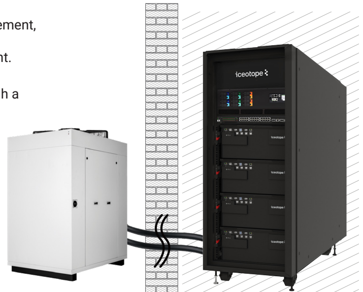
OUTDOOR COOLER *NOT TO SCALE