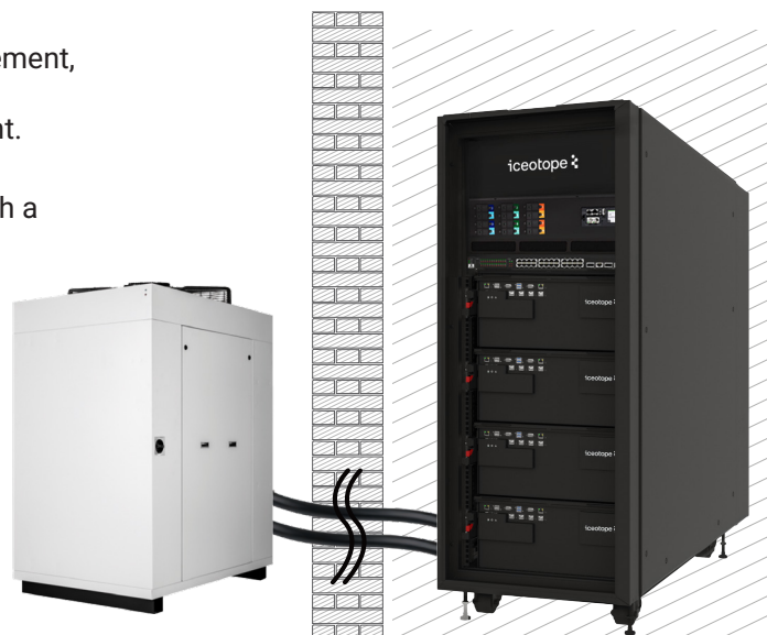
OUTDOOR COOLER *NOT TO SCALE