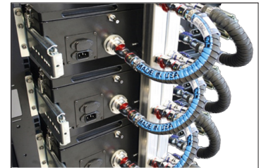
CHASSIS REAR COOLANT CONNECTION