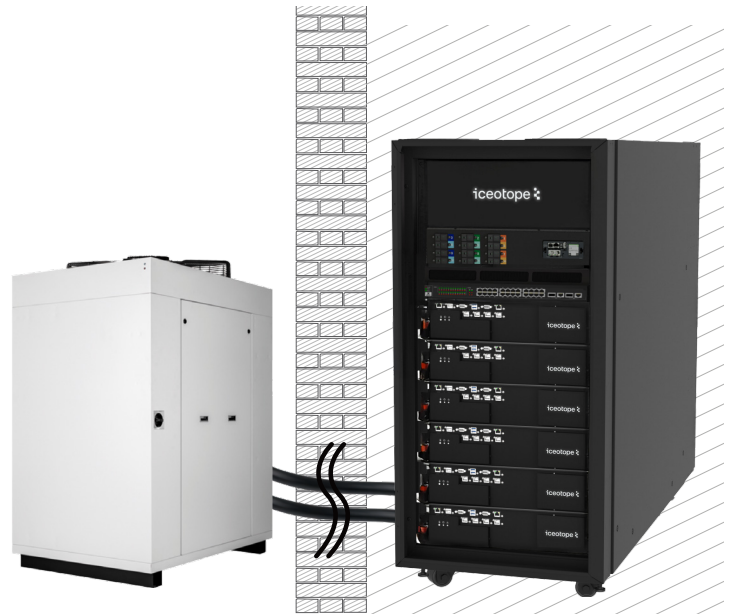
OUTDOOR COOLER *NOT TO SCALE