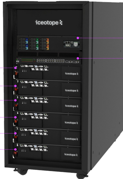
FOR FURTHER INFORMATION ON SERVER COOLING TECHNOLOGY CLICK HERE .