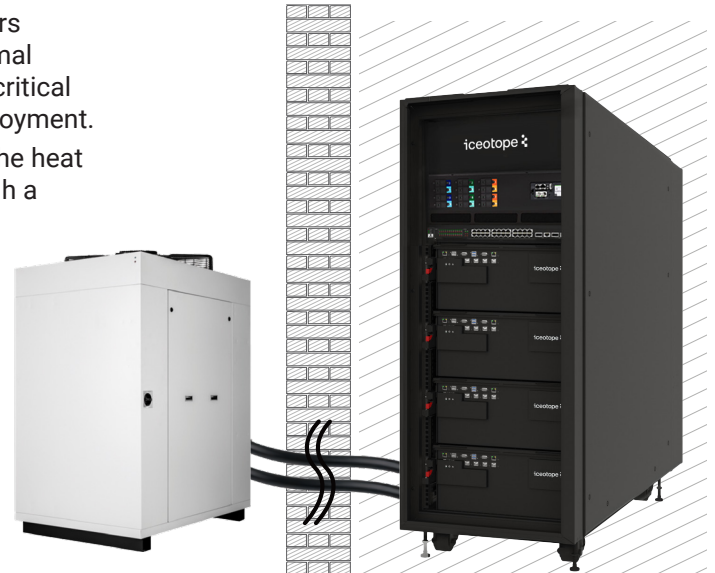
OUTDOOR COOLER *NOT TO SCALE